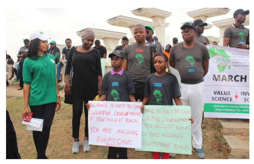
Participants of the Science march showing why they are Marching

deployed to every aspect of modernization and in sectors like Agriculture, Medicines, Environment, Education, Industry, Electricity, Aviation, Information, etc for both developing and developed Nations.