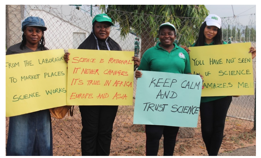
Participants of the Science march showing why they are Marching